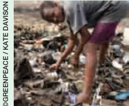
Ghana Boy scavenging e-waste for any electrical components from which he can reclaim the copper.