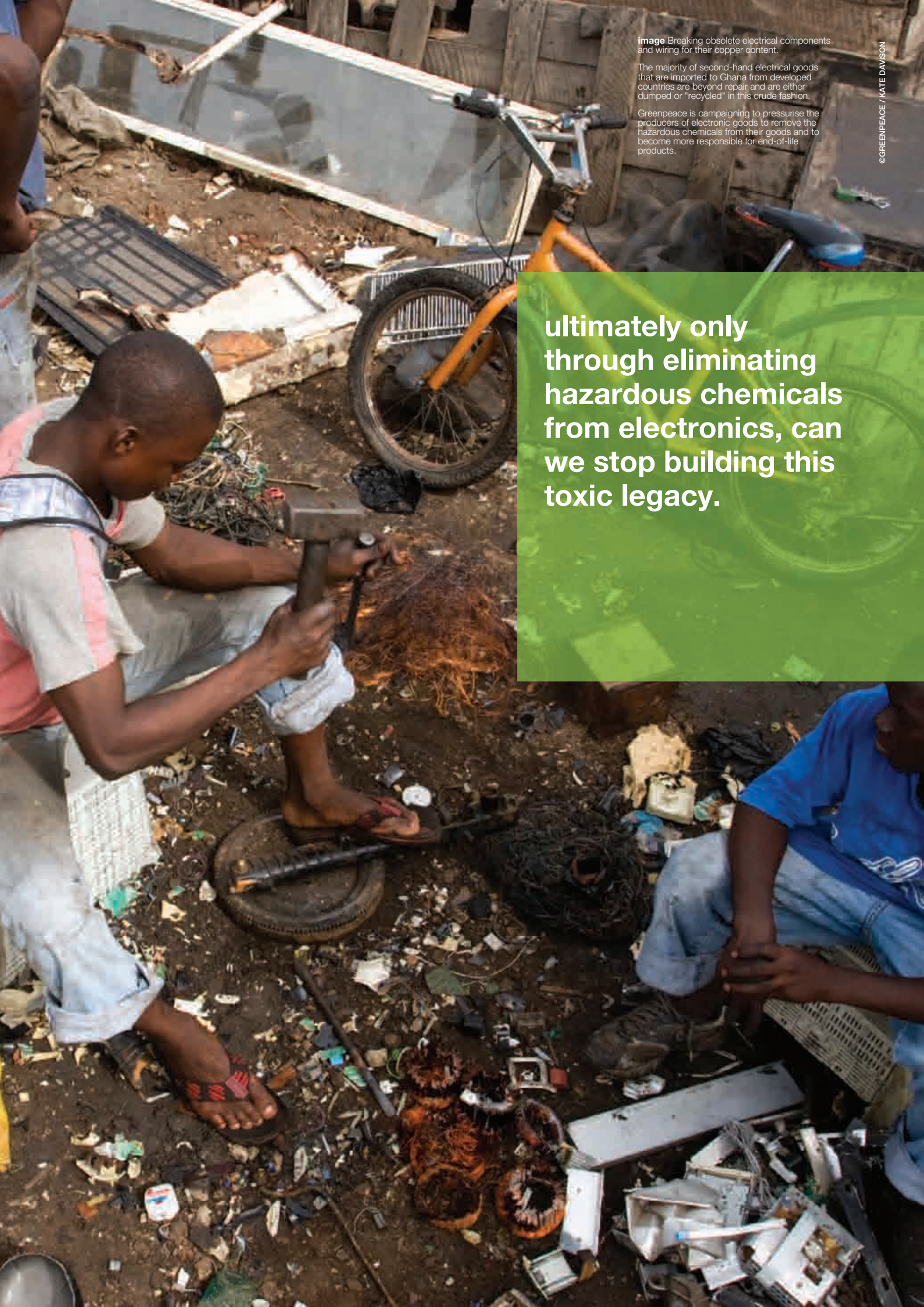
image Breaking obsolete electrical components and wiring for their copper content.

The majority of second-hand electrical goods that are imported to Ghana from developed countries are beyond repair and are either dumped or "recycled" in this crude fashion.