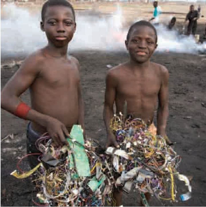
image Boys carrying bundles of electric cables and other parts. Burning the wire covers and cables (to extract the copper underneath) not only releases toxic chemicals present in their make-up, but the burning itself can create even more dangerous chemicals.