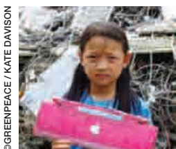
China A young girl displays a piece of e-waste. Children living in an e-waste recycling area in China have been found to have significantly high levels of lead in their blood.