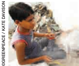
Delhi A boy winces at the smoke rising from computer motherboards being melted over open fires in an e-waste recycling yard.